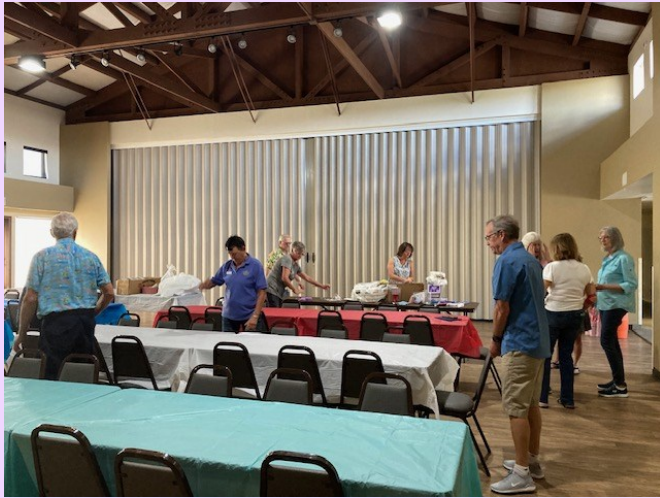
The Setup! Thanks to the Board and some extra hands!