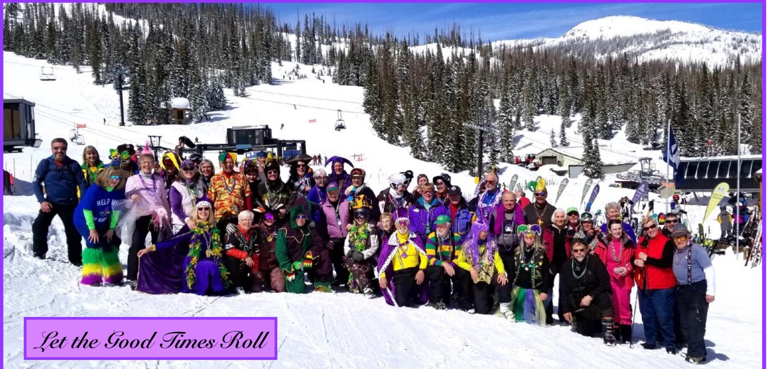
Let the Good Times Roll