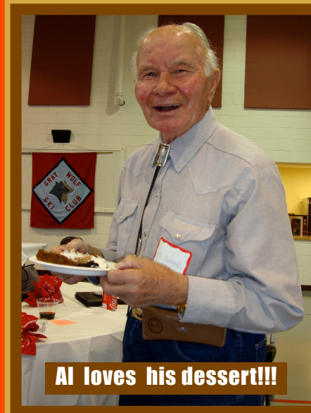
Al loves his dessert!!!

Will Rogers: If you're riding ahead of the herd, take a look back every now and then to make sure it's still there.